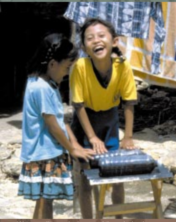
Water quality can be improved through simple measures

The Maldives adopted a national control programme using chlorination in wells and oral rehydration salts for the treatment of diarrhoea, as well as use of rainwater for drinking. 20 years later all the islands in the country are self-sufficient with their own community rainwater collection system tanks. Deaths due to diarrhoea are now a thing of the past.