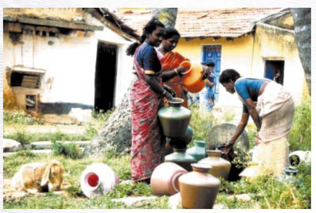
Women's involvement is a key to successful water management.

In the middle of the 20th century, about 50 million people in Africa and Asia were infected with guinea-worm disease. By 1999, that number had been reduced to an estimated 96 000. Guinea-worm disease has been eliminated in Asia and is now prevalent in only 13 African countries. Through measures including the provision of safe drinking-water in rural and isolated areas in these countries, the campaign to eradicate this terrible disease is moving ever closer to its goal.