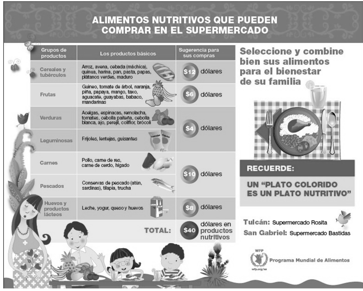
Figure A.1—World Food Programme poster for supermarkets