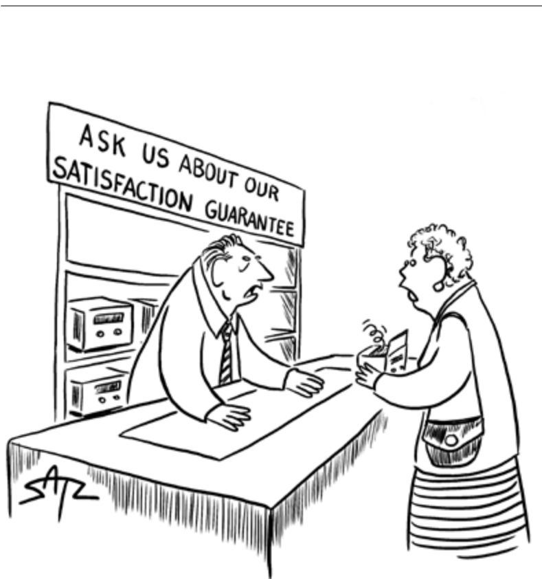
“There isn’t one.”