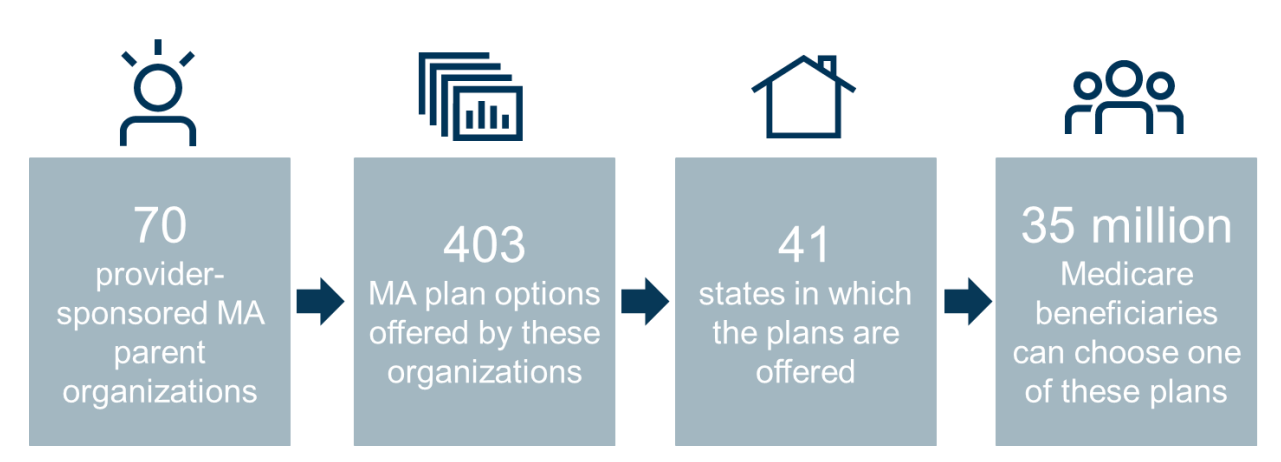
Figure 2: 2016 Provider-Sponsored MA Plan Offerings<sup>6</sup>

Information on new entrants in 2016 also underscores the trend toward provider-sponsored plan participation in MA. Indeed, 58 percent, or 11 out of 19, new MA parent organizations in 2016 are provider-sponsored.<sup>4</sup> As displayed in Figure 2, 70 provider parent organizations will offer 403 MA plans in 41 states to 35 million Medicare beneficiaries in 2016.<sup>5</sup> In total, 64 percent of Medicare beneficiaries will have access to a provider-sponsored MA plan.