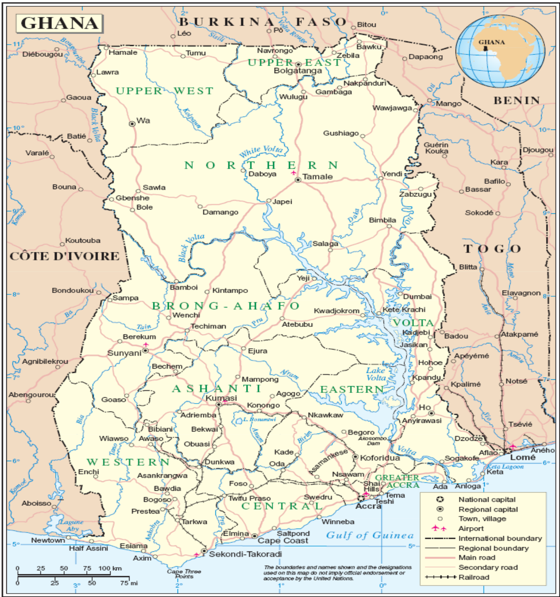
Fig. 1: Map of Ghana

A United States Census Bureau estimate for 2008 shows Ghana's population at 23.4 million, with half the population being below the age of 15. The current growth rate of the population is estimated at 1.9 per cent (US Census Bureau, 2008).